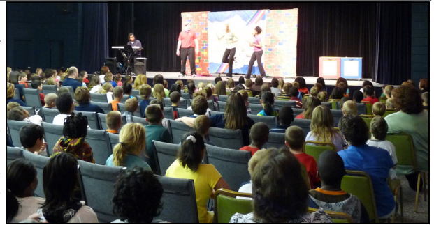
Above students attend an Arts in Education program, April 2010

The CCS Arts in Education program has established a series of wonderful programs for area school children to enjoy through the 2010-2011 school year. For an admission of $2.00 per student, quality programming is provided to about 900 students during the three performances that are offered throughout a scheduled program day.