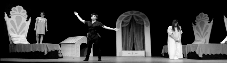
On March 25, 26 & 27, the Centralia High School Drama Club presented their spring musical "Peter Pan" on the stage of the Community Arts