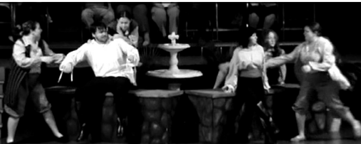
Actors in Action presented Shakespeare's "Much Ado About Nothing" over 2 weekends, May 14, 15, 21 & 22.