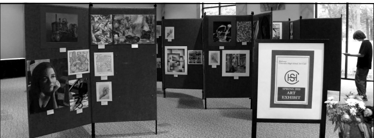
The front gallery held 2 exhibits in May; the Light & Lens Camera Club's "Spring Photography Exhibit", "followed by the "Centralia High School Art Show" pictured above.