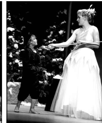
Scenes from the summer children's theatre production of "The Lion, the Witch and the Wardrobe", June 25, 26 & 27.