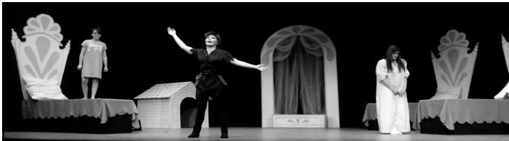
On March 25, 26 & 27, the Centralia High School Drama Club presented their spring musical "Peter Pan" on the stage of the Community Arts